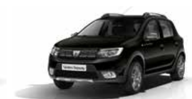
Pearl Black (676)