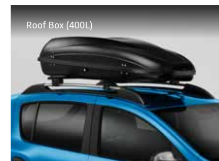
Roof Box (400L)