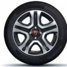
16" 'Flex Stepway Style' alloy-look wheels