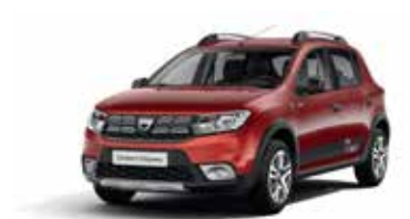
Fusion Red (NPI)