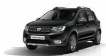
Slate Grey (KNA)