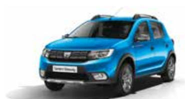
Azurite Blue (RPL)