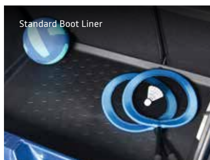
Standard Boot Liner