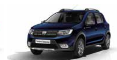
Cosmos Blue (RPR)