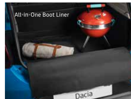
All-in-One Boot Liner