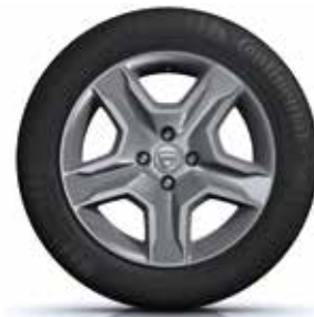
16" 'Stepway' Design Wheels

Throw in a choice of impressively reliable engines, ABS, Emergency Brake Assist (EBA) and Electronic Stability Control (ESC) . It's quite the performer.