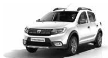
Glacier White (369)