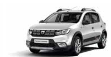
Highland Grey (KQA)