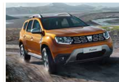
All-New Duster Awards: