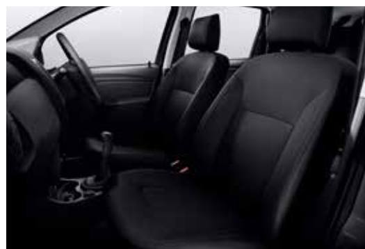
'Bainite' cloth upholstery