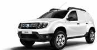
Glacier White (369)