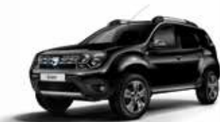
Pearl Black (676)