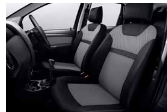
'Graphite' cloth upholstery