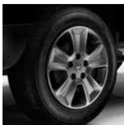
16" 'Tyrol' alloy wheels