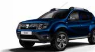
Cosmos Blue (RPR)