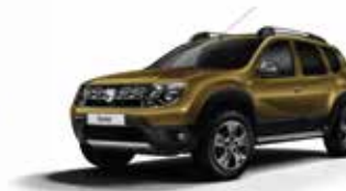
Altai Green (DPC)