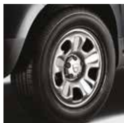
16" 'Matterhorn' steel wheels