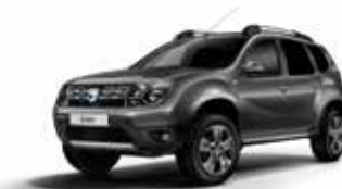
Slate Grey (KNA)